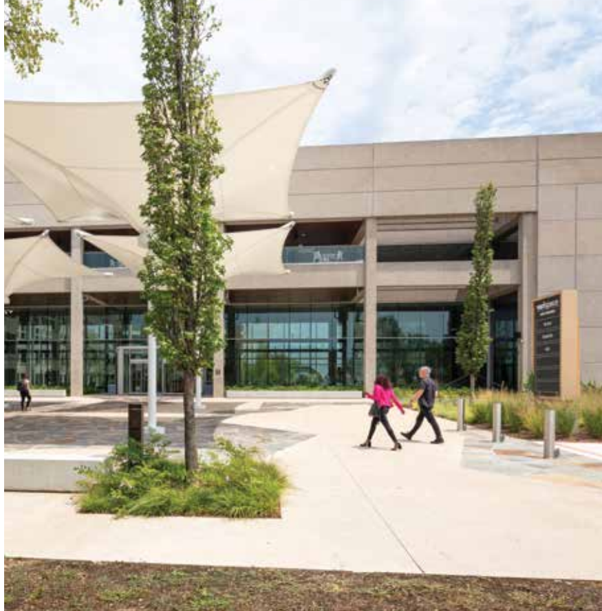
VariSpace® Las Colinas