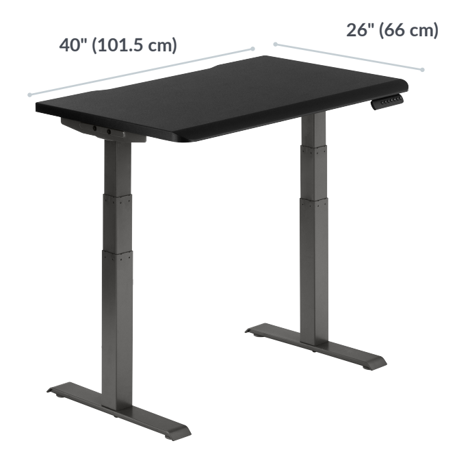
Height Settings: 25" (63.5 cm) to 50 ½" (128 cm)