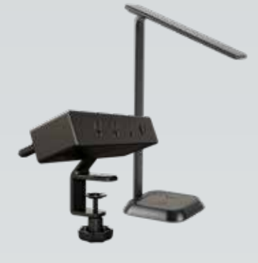
Power & Lighting