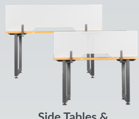
Side Tables & Privacy Panels